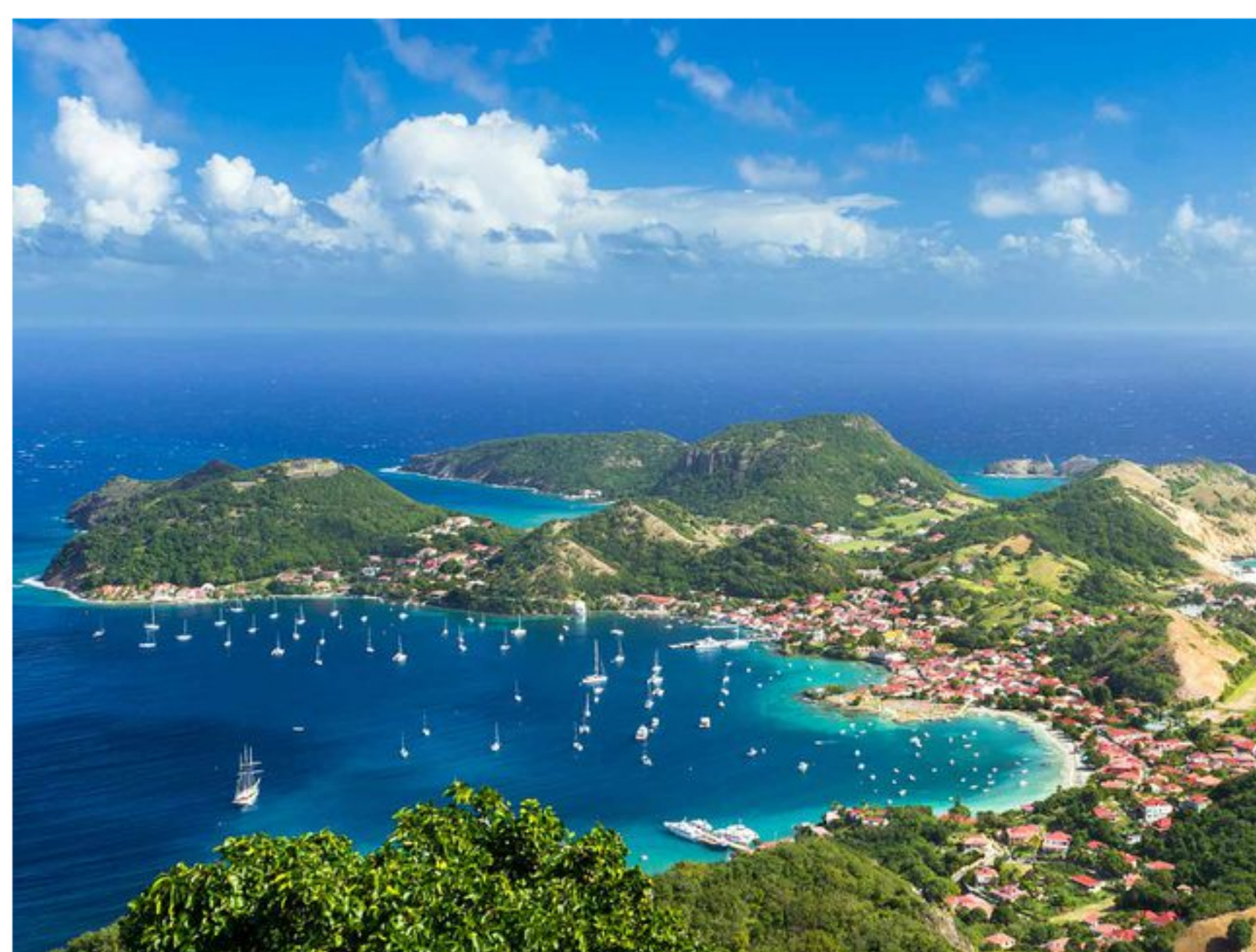
Best Things to Do in Guadeloupe

You can't travel to the Guadeloupe Islands and not explore its waters via snorkeling or scuba diving. If you're not keen on getting wet, fear not: There are glass-bottom boats to take you around the islands' clear waters, showcasing colorful marine life. Like other Caribbean islands, the beaches on Guadeloupe are sights to behold, and visiting them should be at the top of your things to do list . Some are only accessible by dirt roads, so be ready to get your feet dirty (don't worry; you'll wash them soon).