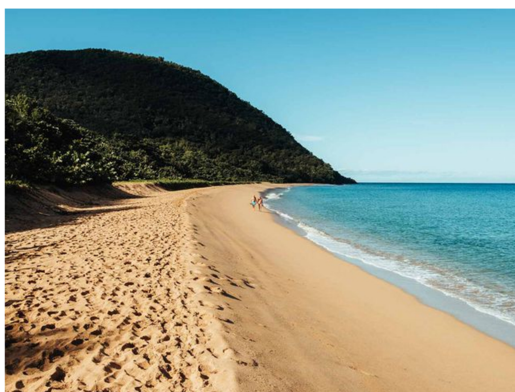
5 Things to Know Before Your First Trip to the Guadeloupe Islands