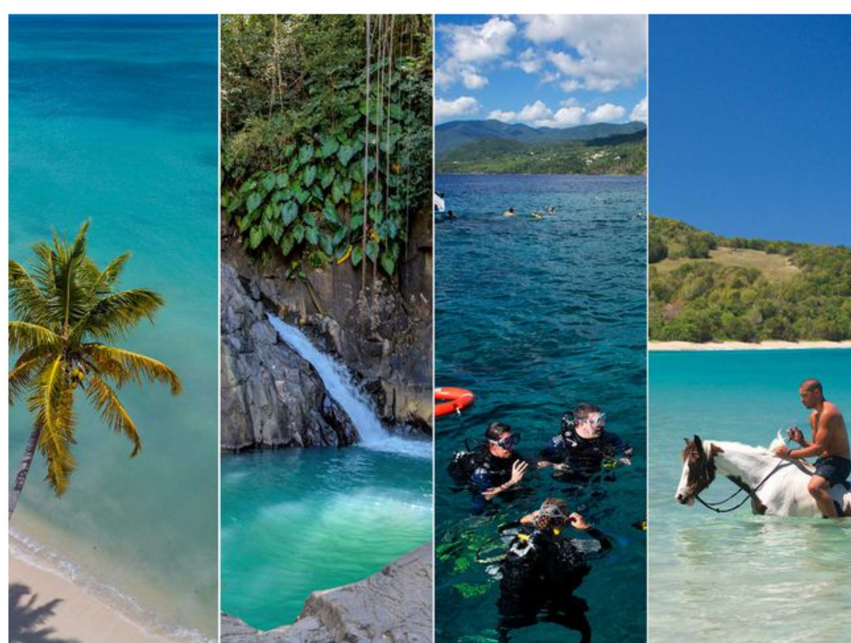
The Time in the Spotlight Has Come for the Guadeloupe Islands