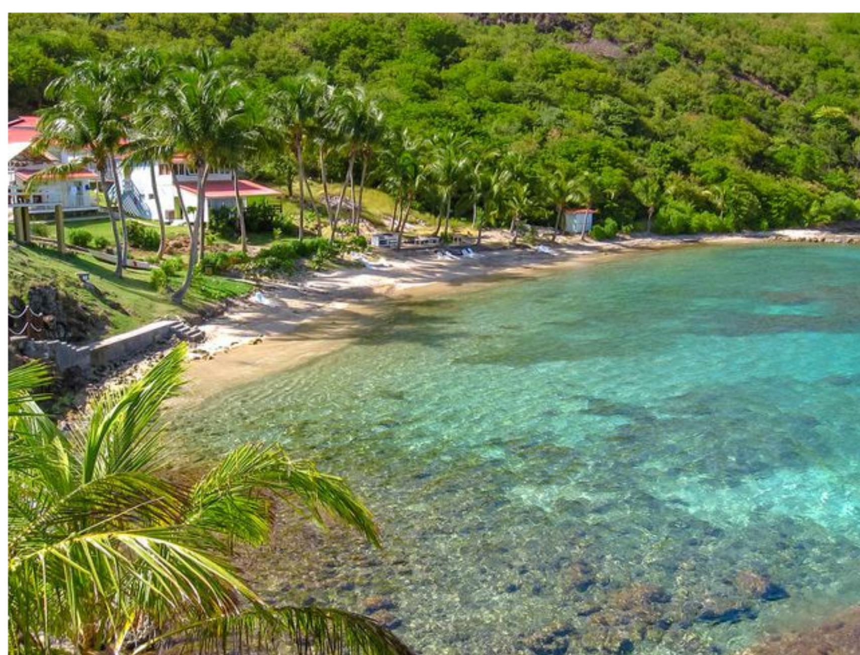
Best Snorkeling Spots in Guadeloupe