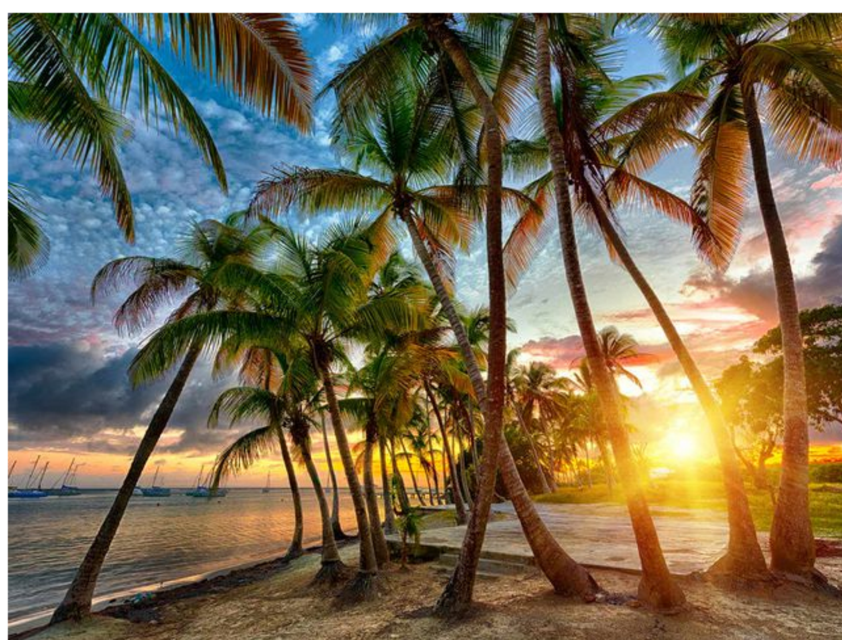
Best All-Inclusive Resorts in Guadeloupe