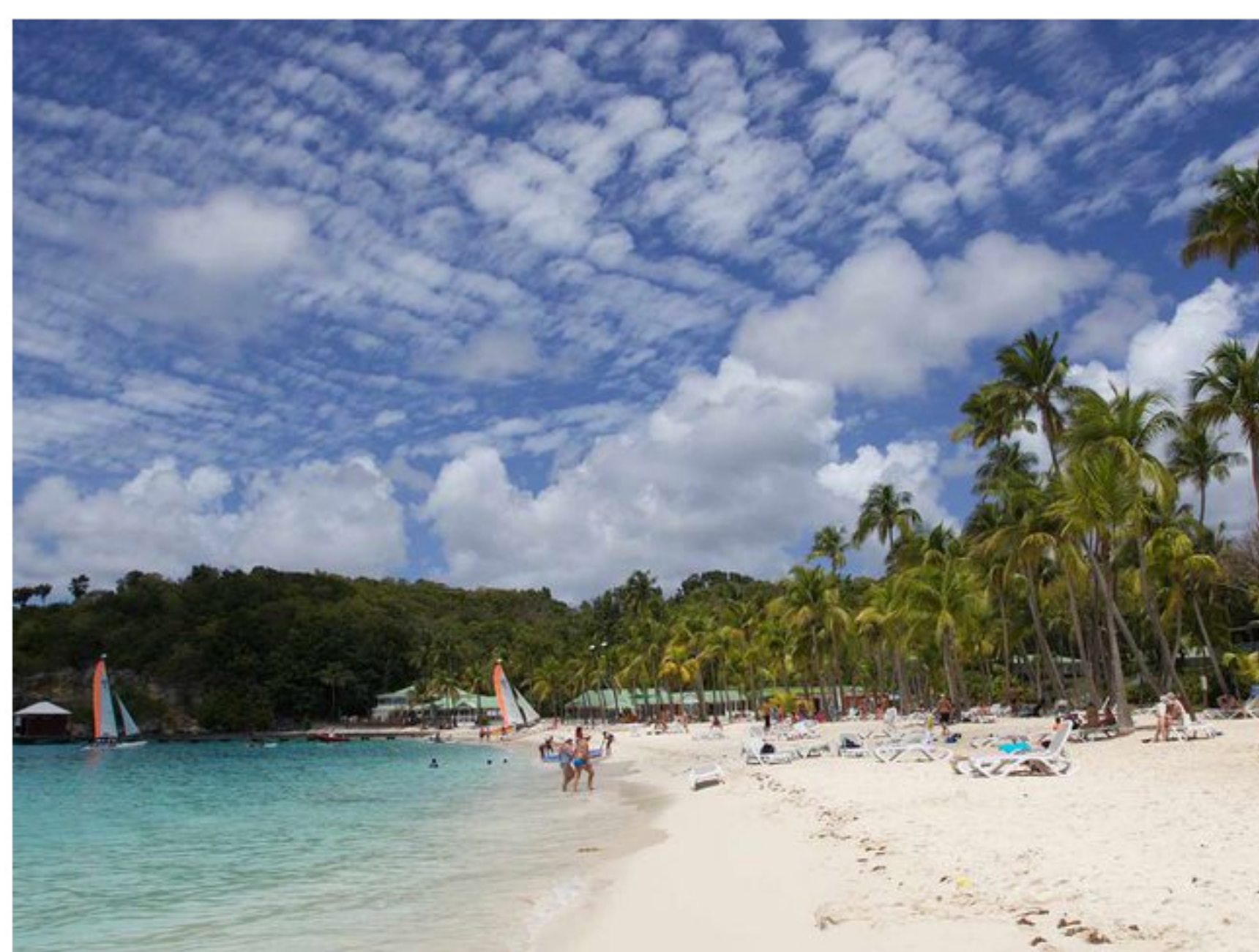
Best Hotels and Resorts in Guadeloupe

The Guadeloupe Islands are in the Caribbean, so you know it follows its fellow islands when it comes to providing the best hospitality at its resorts and hotels . Many Guadeloupe resorts are beachside, of course, so you'll never long for sand between your toes. It's not a Caribbean island without a few all-inclusive resorts , too, touting unlimited access to local food and beautiful vistas from infinity pools, among other amenities, making a Guadeloupe vacation worthy of splurging.